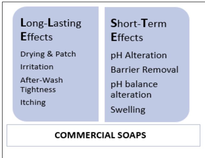
Figure 1: Harmful impacts of Commercial Soaps